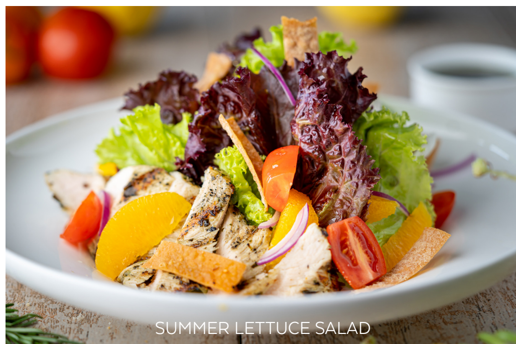
SUMMER LETTUCE SALAD