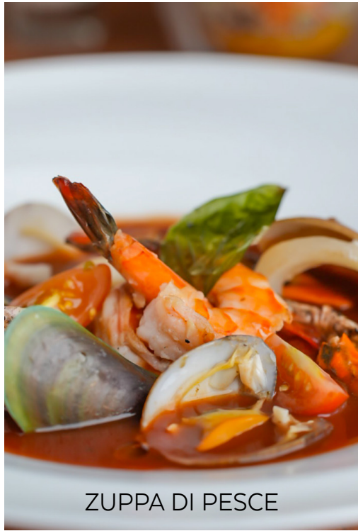
ZUPPA DI PESCE