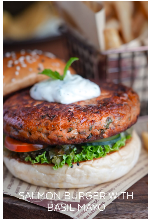
SALMON BURGER WITH BASIL MAYO