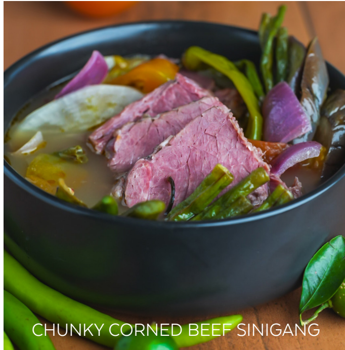
CHUNKY CORNED BEEF SINIGANG