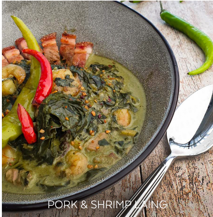
PORK & SHRIMP LAING