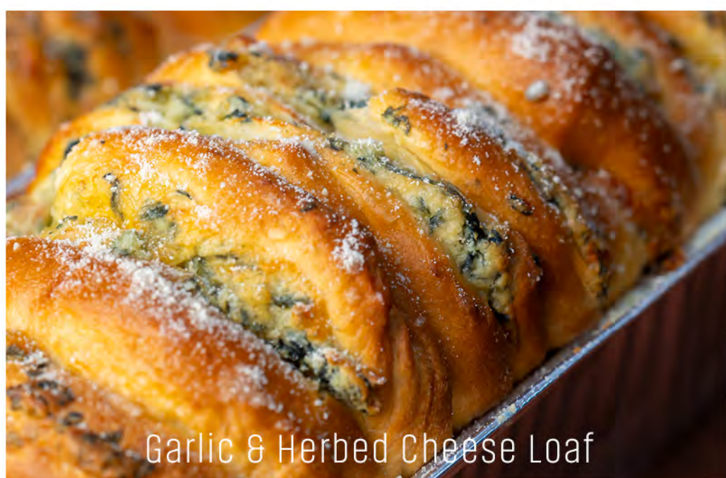
Garlic & Herbed Cheese Loaf