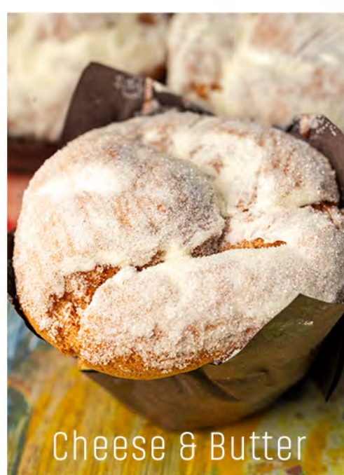
Cheese & Butter