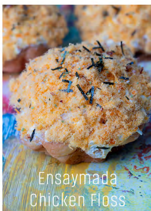
Ensaymada Chicken Floss